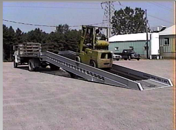
Or ground to truck application.....