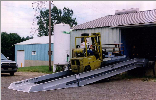
Whether a dock to ground .....

➤ Available in 12, 16 & 20,000 lb. capacity ratings.